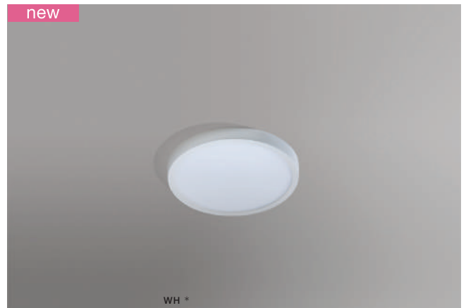
MALTA R 23 3000K / 4000K