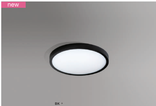
MALTA R 30 3000K / 4000K