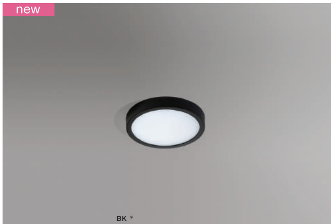
MALTA R 18 3000K / 4000K